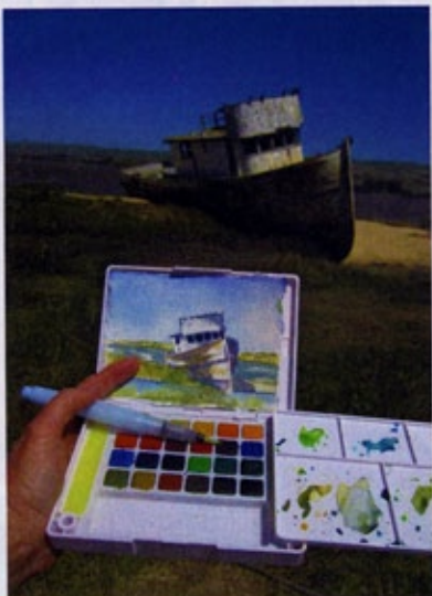
In the Field I used the 24-color set, along with a few of my own favorite colors, to paint this plein air landscape (watercolor on paper, 4x6).

Once I relaxed, I switched the subjects to tropical flowers. This is when the kits' colors started to work out for me. The brush delivery isn't the same as a normal watercolor brush, meaning it can lay down a pretty decent puddle of water but doesn't mop water back out as well, due to the brush's fibers. Simply use a paper towel